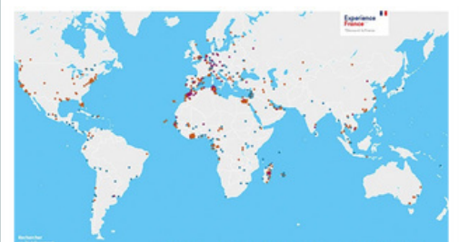
The French international schools network

After completing their education at the LFIR, students can seamlessly move to other international French schools or other international school systems. Those who have completed high school and obtained their "baccalauréat" can join international Universities. For those wishing to study in France, a variety of scholarships are available.